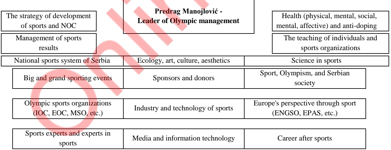
Scheme 2 . Program activities and joining the ends of the ontological continuum of sports development in the idea devised by Predrag Manojlović